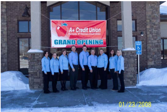
Opening Day scene on a frosty January one year ago.

Our newsletter has a new look and name. That's because the credit union has been open at the new location for one year. Based on suggestions from members, we're changing the name of the letter from Cambridge Quarterly to The Sunnyside Times reflecting our move to Sunnyside Road. We know we are not the only financial institution on Sunnyside, but we are the most committed to serving education in Bonneville County!